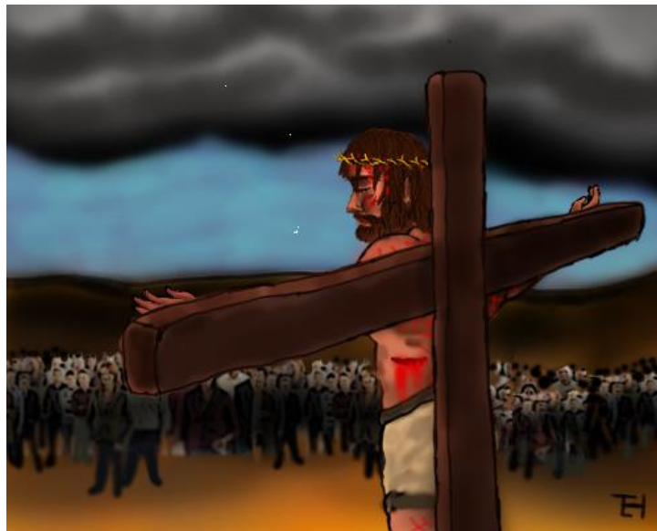
Christ died for sinners!

Roma 6:23 Pegge' tumbas si me' a'a magdusehin sudda matey siye duk tapī siye si narka'. Saguwa' lasa-lasahan Tuhanin umul ga' niya' tamananne si surga' sabab bakas tahinang Isa Almasi, Panuhutanten bi.