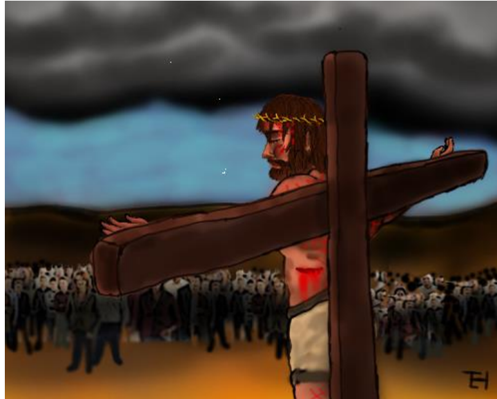
Christ died for sinners!

RŌM 6:23 Tagna', bay kitam tabanyaga' e' dusa ati kamatay ya tungbasna, saguwā' kallum kakkal ya pangahilas Tuhan ma kitam bang si Isa Al-Masi Panghū'tam ya pameya'antam.