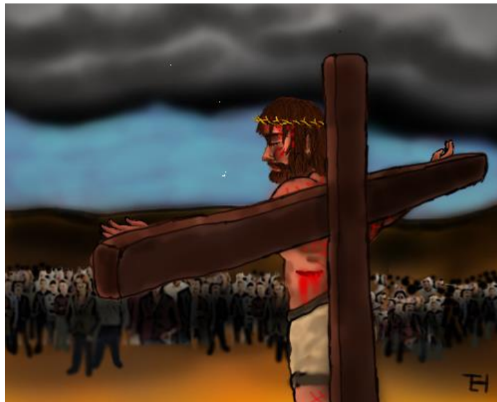
Christ died for sinners!

Roma 6:23 Gapu kamatayan en bayad nen kasalanan, peru en awan ti bayad a rigalu nen Diyos ay biyag a awan ti katapusan, ten pamamag-itan ni Cristo Jesus a Panginoon tam.