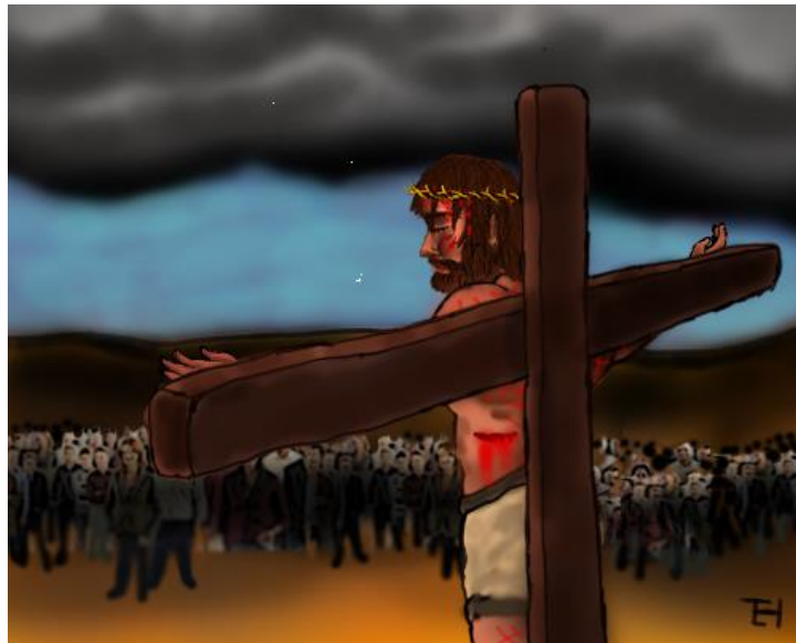
Christ died for sinners!

Roma 6:23 Gawan hêpat ha kasalanan ya kamatsan, ya main parusa ya ayn angga, noa, biyay ya ayn angga, ay an-idigalo ni Apo Namalyari, gawan ha pakikimiha tamo kan Panginoon tamon Jesu-Cristo.