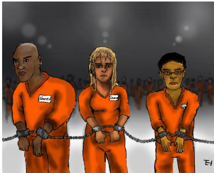
We are all sinners!

Roma 5:12 Maipagapu utdit osa'n tagu, nailugi dit basul situn lubung. Ot gapu utdit basul na nambanaga awad katoy. Kadon nansaknap dit katoy sidan losana tagu gaputa losana tagu nakabasul.