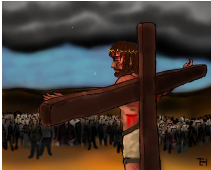
Christ died for sinners!

Roma 6:23 Ta iyaw panangdan no gatos, ki kadiman. Ki iyaw sāgot ni Āpo Dyos dyaten, ki byay a abos pandan maynamot do kapachasa ta di Kristo Jesus a Āpo ta.