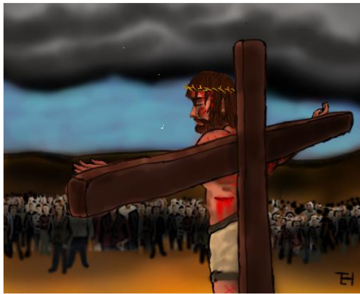
Christ died for sinners!

Roma 6:23 Se ino liwat, tandananneno aripannera, e ino tandanda, ino katayana awana pakkiyaranna. Udde i Dios, rigalu pelangino iya'dana, e antuweno biyaya manayun gafu sino kesapatantam ki Kristo Jesus a Afutam.