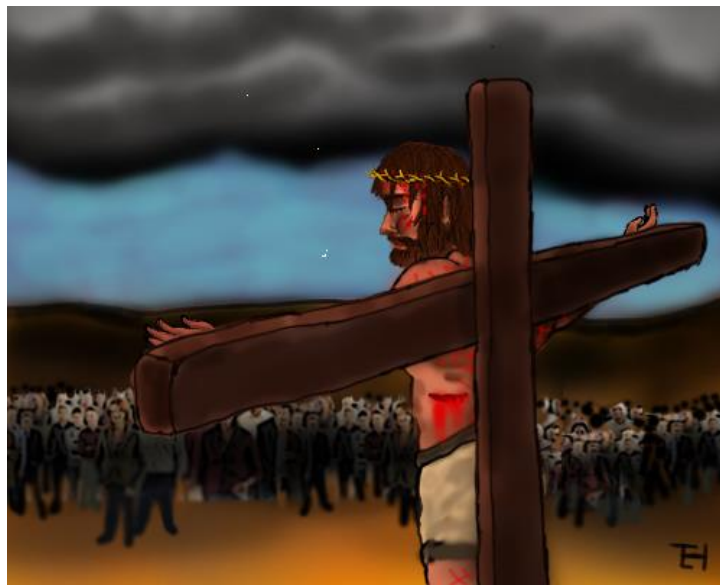
Christ died for sinners!

Roma 6:23 I hukom na nagliwaliwat a biyag ket katay ken parusa a awan kahad. Ngem biyag a magnanayon i isagut na ha ngamin a neraman ha ni Jesu-Cristu a Happo tam.