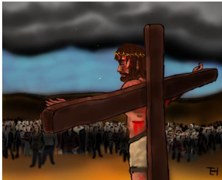
Christ died for sinners!

Tigruma 6:23 Ke zuen etew he ebpevayàbayà te suat te mekesesalà he lawa zin ne zuen silut kandin he iyan is kemetayen he wazè din pidtemanan. Iyan, is etew mulà he edtuuwan din si Jesu Kristu he Nengazen tew, duen ibegey kandin te Megbevayà he iyan is untung he wazè din pidtemanan.