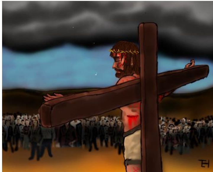
Christ died for sinners!

Roma 6:23 I untung i kimò salà dunan fati landè gusenán, bay i blé Dwata landè bayad dunan nawa landè gusenán fagu di ku Krayst Dyisas Amuito.