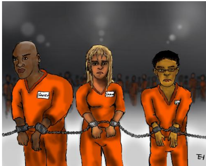
We are all sinners!

Roma 5:12 Mdà di salà Adam, én i katbù kagsalà i dad to, na mdà di salaan mati Adam. Taman i kdee dad to mati, du landè to i là gamsalà.