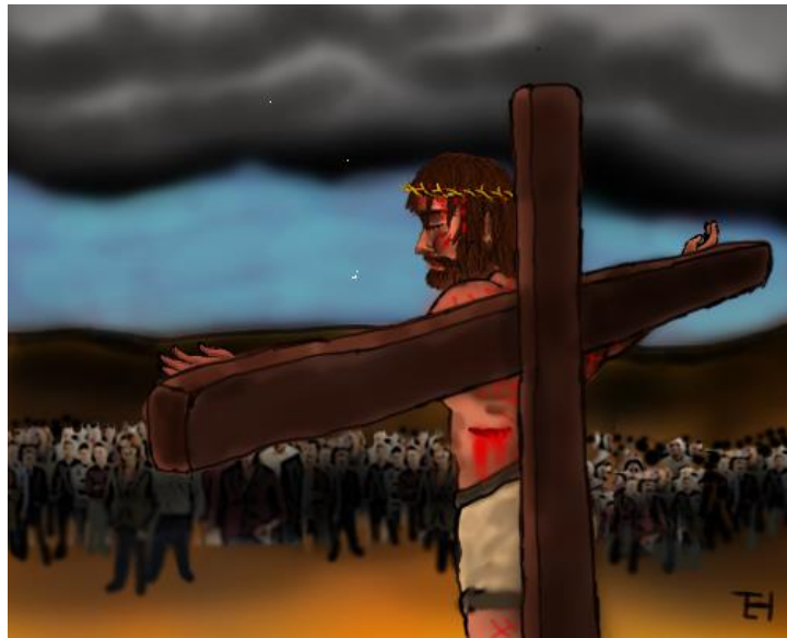
Christ died for sinners!

RŌM 6:23 Tagna', bay kitam tabanyaga' e' dusa ati kamatay ya tungbasna, saguwā' kallum kakkal ya pangahilas Tuhan ma kitam bang si Isa Al-Masi Panghū'tam ya pameya'antam.