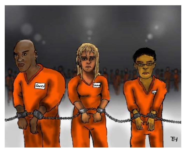
We are all sinners!

Lucas 18:13 Pero no maparo aya a mangolekta no Roma am naytetnek do mandichod na as katod na komheb a tomogtog so kalangangan na as kavata na sia, 'Dios, ichasi mo yaken ta makagatogatosen ako.'