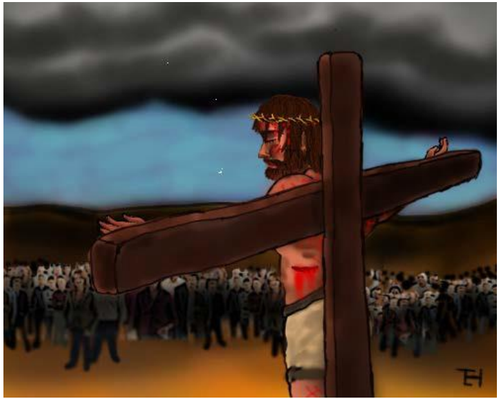
Christ died for sinners!

Lucas 24:46 e sinapi'na sikwara si, "Kunnayawino neturak mappeafu sikwak. Maawag si madyatan anna matayino Kristo, kasena mangngangoli sino mekatalluwa aw.